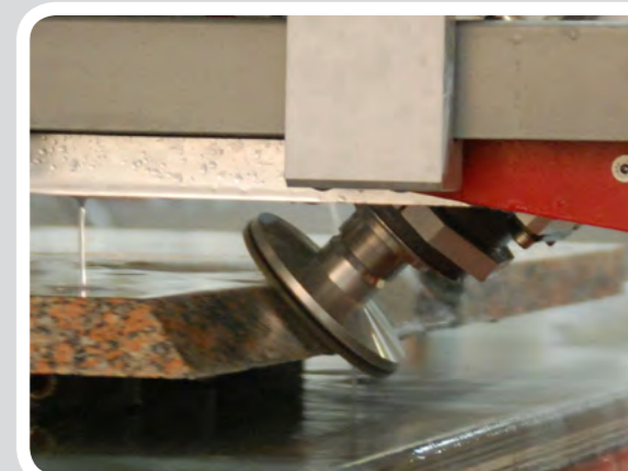
Straight and inclined edge polishing

SYSTAR BASIC is a sturdy and well-designed machine capable of performing all the processing required to a stone fabrication workshop: shaping and polishing of internal and external profiles, bevelling, drilling faucet holes, cutting sink cut-out and drain-boards; grooves and slots on edges, vertical and inclined cuts at 45°, polishing of straight and inclined edges. You will be able to create kitchen and vanity tops, arches, sills, stairs, shower bases, gravestones, and many other stone pieces extremely easily.