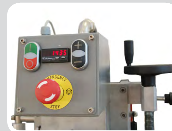
▲ Control panel (24 V AC low tension controls)