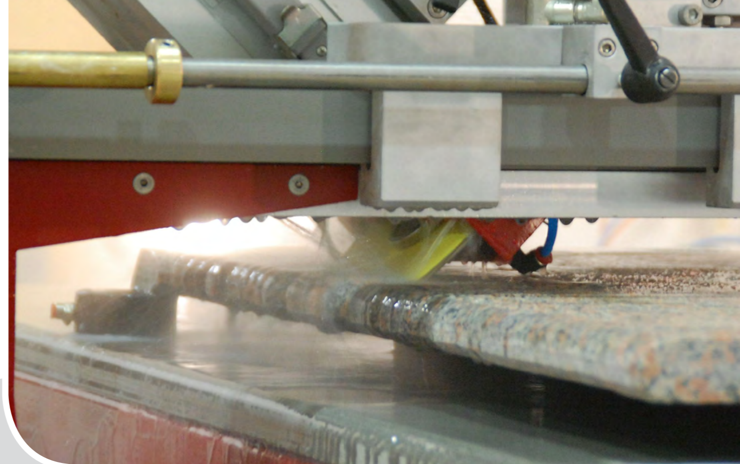
Inclined cuts at 45°

▲ Spindle equipped with double water lubrication system: internal for CNC tools and GTOOLS diam. 22,2 mm for manual machines, and external.